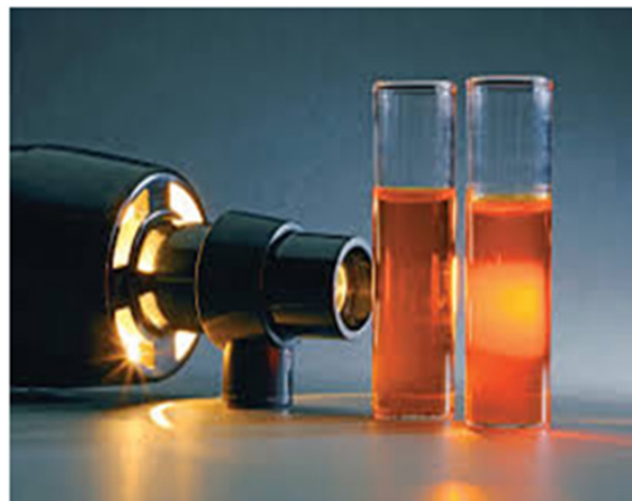
Figure 2 Viewing the colloidal particle size of silver using a laser beam.

A quick way to see if a solution contains colloids is by observing the Tyndall effect. A clear colloidal dispersion will appear turbid when a sharp and intense beam of light is passed through. The scattered light also takes on a cone shape within the solution. A simple way to observe this is to shine a very bright flashlight through a test tube of the dispersion in a dark room (Figure 2).