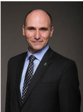
Minister of Health

Meet the Public Health Agency of Canada's leaders.