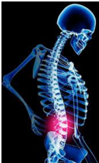
Figure 1 Chronic inflammation and degeneration of the joints and organs.

In contrast and in the reverse, my thirty years of hematological research suggests that any inflammation and/or degeneration of tissues, joints and/or organs is the result of tissue, joint and/or organ acidosis from the retention of dietary, metabolic, respiratory, and environmental acids that have not been properly eliminated or excreted through the four channels of elimination – urination, perspiration, defecation and/or respiration. My own research suggests that acid retention primarily from diet and metabolism breaks down tissues, joints and/or organs that causes the activation of the white blood cells as a janitorial cleansing mechanism rather than a mechanism that attacks and destroys invading microorganisms or mistakenly attacking healthy or unhealthy joints, tissues and/or organs. 1,2